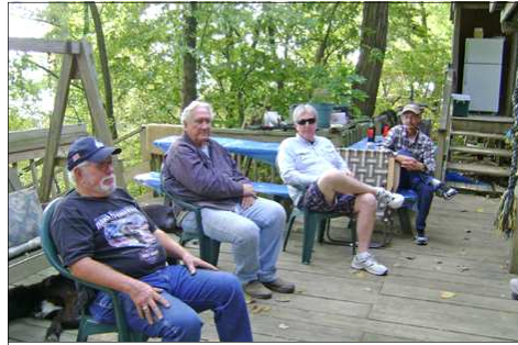
Men on one side, the women on the other